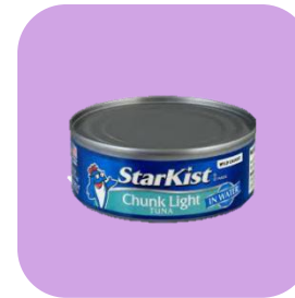
Canned Chicken and Tuna