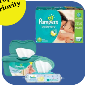
Diapers & Baby Wipes (sizes 4-6 preferred)