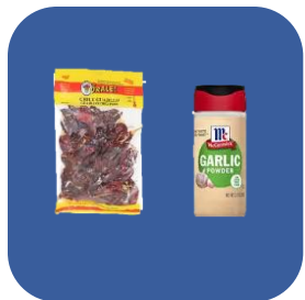
Spices/Seasonings (including dried peppers)