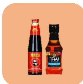
Oyster & Fish Sauce